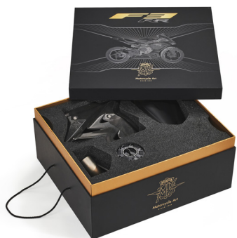
F3 RR RACING KIT