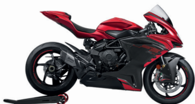
ROSSO FUOCO OPACO/GRIGIO SCURO METALLIZZATO OPACO (RACING KIT**)