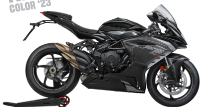
METALLIC CARBON BLACK (GLOSS)/ METALLIC DARK GREY (GLOSS)