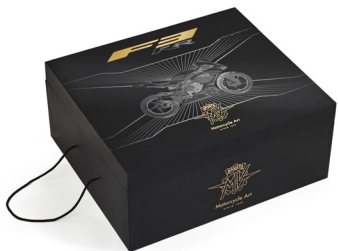
F3 RR DEDICATED KIT