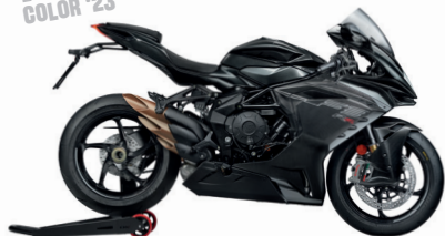
NERO CARBON METALLIZZATO/ GRIGIO SCURO METALLIZZATO