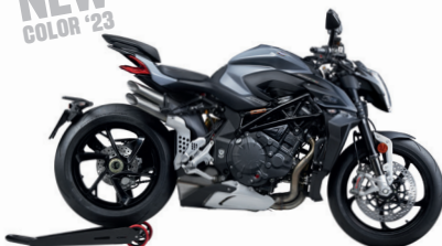
GRIGIO NARDO/ GRIGIO SCURO METALLIZZATO OPACO