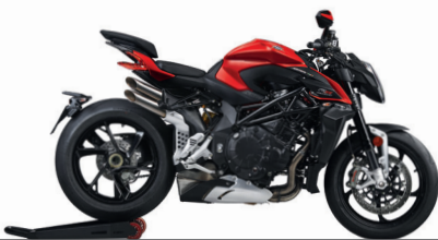
ROSSO AGO/ GRIGIO SCURO METALLIZZATO OPACO

E10 SOLO BENZINA SENZA PIOMBO ETANOLO FINO AL 10% DI VOLUME