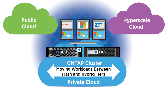
Figure 3) AFF is Data Fabric ready. You can easily move data between tiers and clouds.

AFF systems are built with innovative inline data reduction technologies, including inline compression, inline deduplication, and inline data compaction, that provide space savings of 5 to 10 times, on average, for a typical use case. Actual space savings of much higher than 10 times have been reported by our customers. Additional benefits of these technologies are as follows: