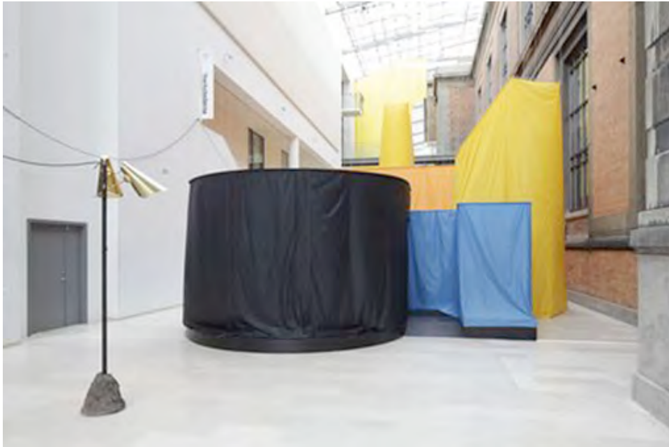
FOS, One Language Traveller , 2011.

On your way through One Language Traveller , you constantly encounter evidence and elements that point back to earlier meanings yet forward to upcoming parts and meanings.