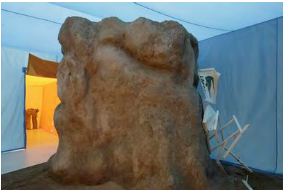
FOS, One Language Traveller , 2011.