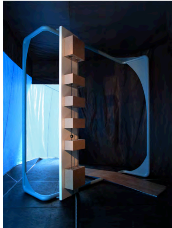
Krüger & Pardeller, Minimal Act, 2011

The sound of your own footsteps is recorded and sent scrambled out through the speakers somewhere else in the installation. Sophisticated street lights mark a zigzag route through the space and bind the installation together. The route takes the traveler through enormous membranes to other areas and through a grid-like structure, with a sign system of symbols.