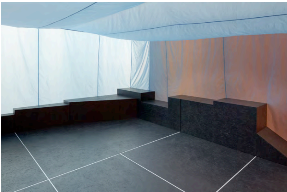
One Language Traveller , 2011.