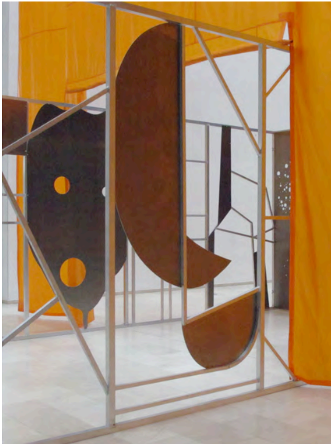
FOS and Krüger & Pardeller, One Language Traveller , 2011

Statens Museum for Kunst / National Gallery of Denmark From 18. June 2011 – 20. June 2012.