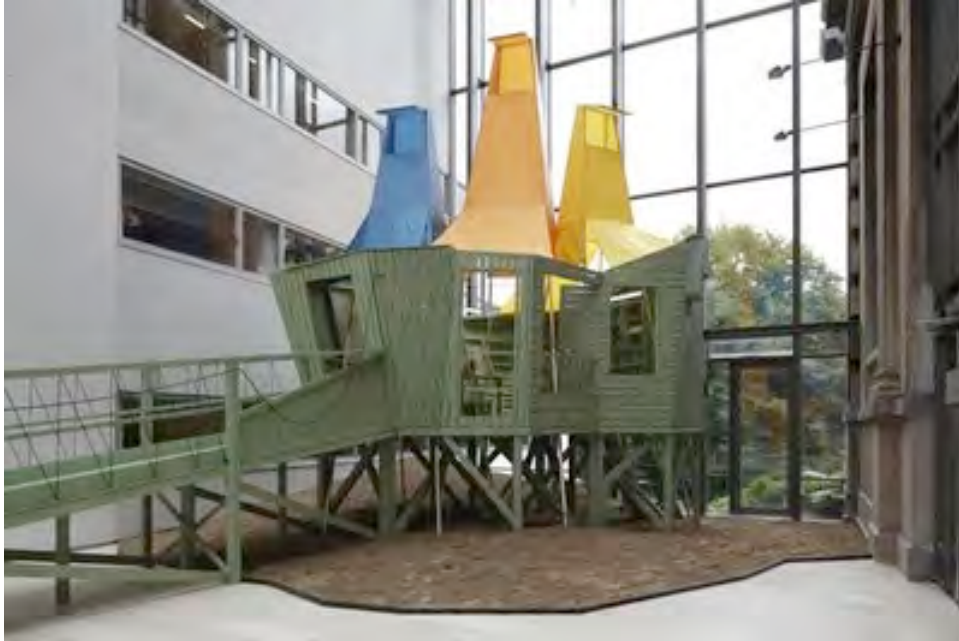
FOS and Krüger & Pardeller, Mountain Factory , 2011.

At the other end of the installation you reencounter a clay mountain landscape. On top of this hill, a factory produces soaps that are shaped like the very first "designed" objects, namely arrowheads and flint axes.