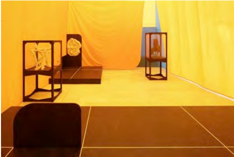
FOS, One Language Traveller , 2011.

In the tent space you pass display cases with objects that seem carefully collected according to specific, but unknown criteria. You go over a clay floor and past a clay sculpture shaped like a steep mountain.