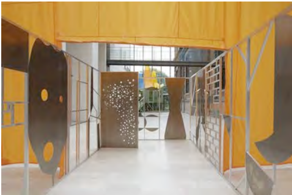
FOS and Krüger & Pardeller, Gate Grid, 2011.