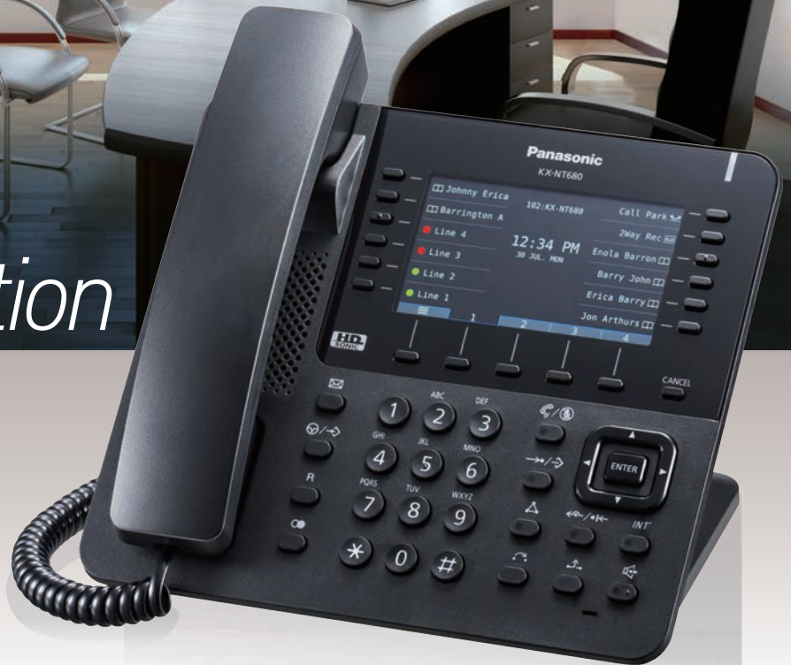
HD SONIC KX-NT680 Colour LCD

With the ever-changing business world in mind, at Panasonic we created a new type of communication equipment, ready for the future. Using a clear colour LCD, integrating High Definition Audio and an enhanced user interface, we provide for the needs of current users.