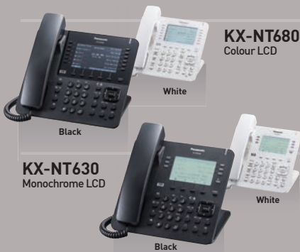
KX-NT680 Colour LCD