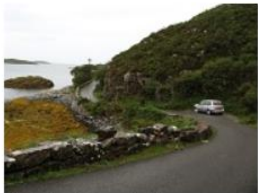
single track near Lochinver