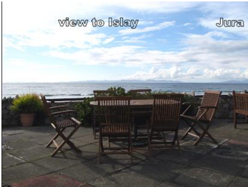
view to Islay and Jura from Kintyre