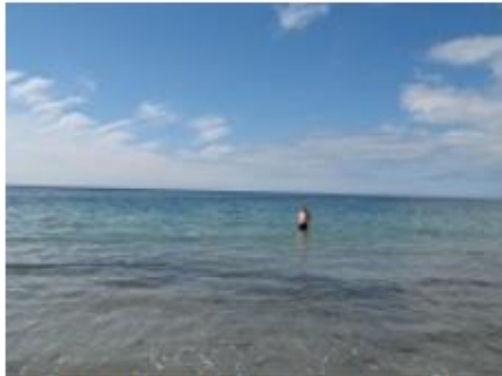
a little bit cold - but a wonderful day