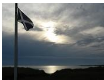
Island of Eriskay in the Outer Hebrides & The Legend of Whisky Galore