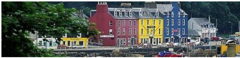
T'bemory Insel Mull