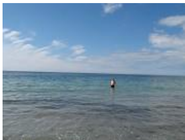
a little bit cold - but a wonderful day