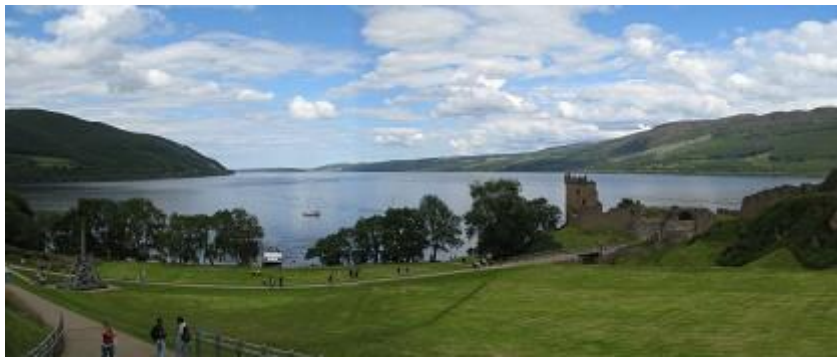
Loch Ness - Castle