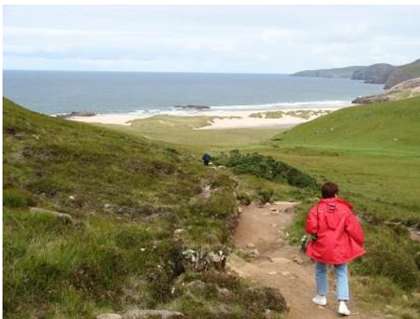
Sandybeach - 18.07.07