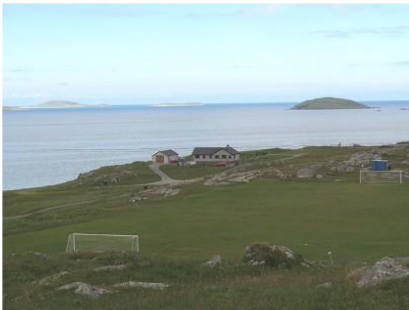
football field on Eriskay - the Outer Hebrides