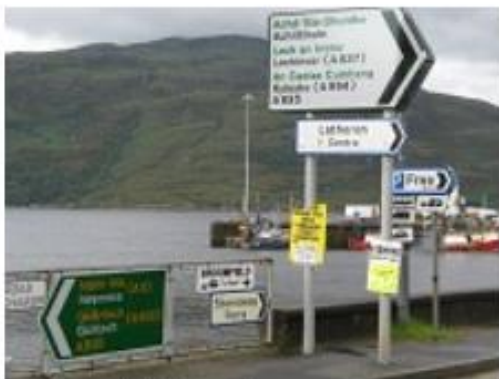
harbor at Ullapool