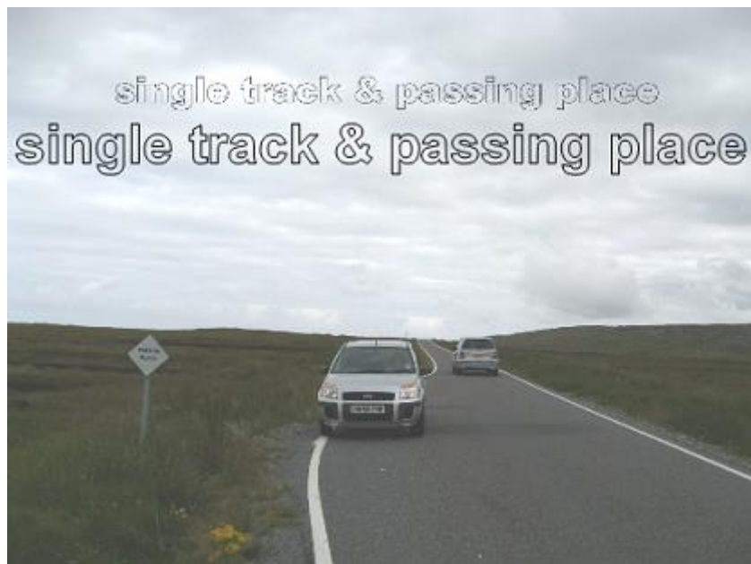
single track with passing place