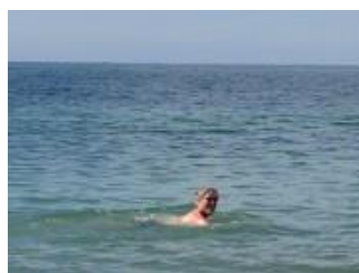
at the Outer Hebrides