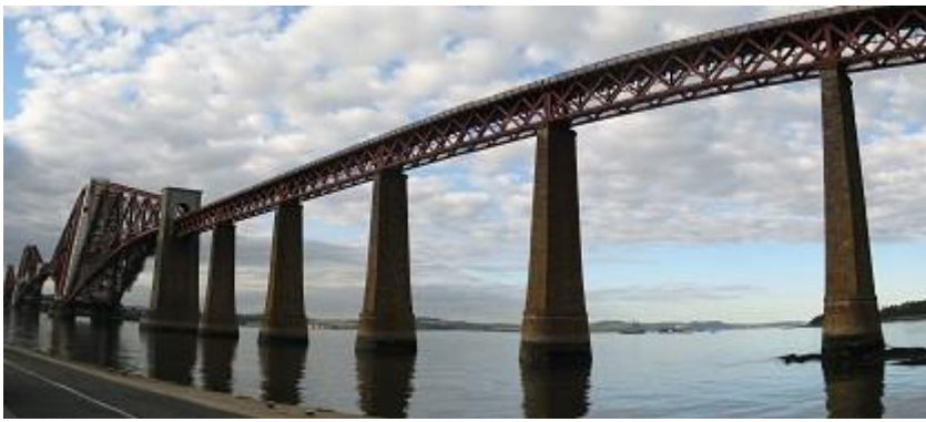
THE FORTH RAIL BRIDGE near Edinburgh over the Firth of Forth - 08.08.07