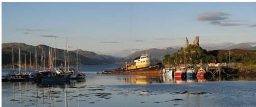
Kylerhea - Isle of Skye (20-07-07)