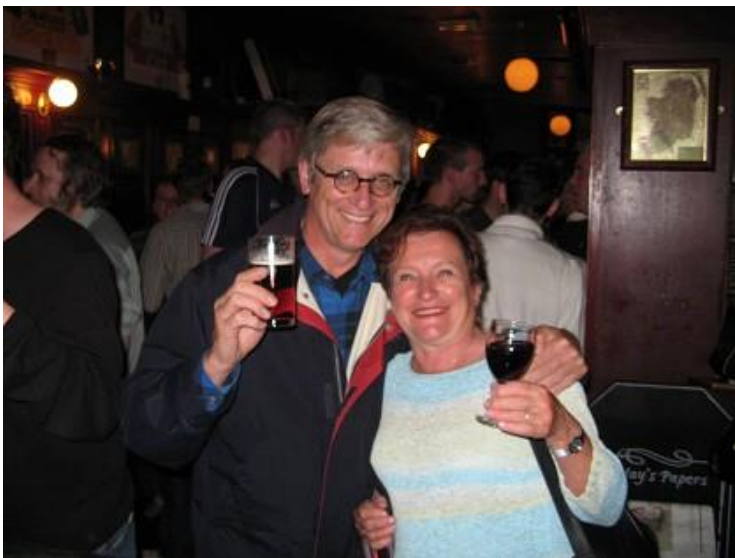
... 4 nights in Glasgow