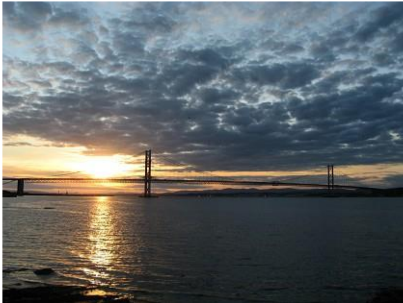
car bridge over the Firth of Forth - 08.08.07