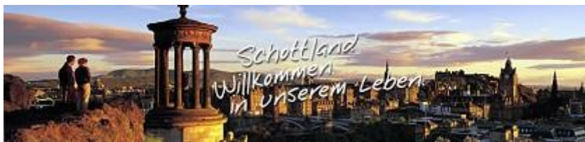
let's discover Scotland this summer..

Willkommen in der Welt der Classic Malts