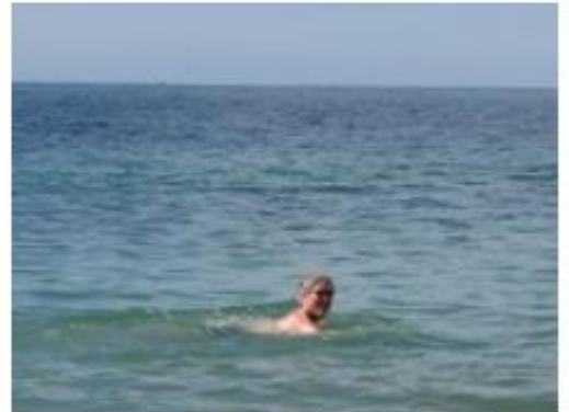
at the Outer Hebrides