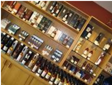
Whisky selction at Cardhu distillerie - click for more!