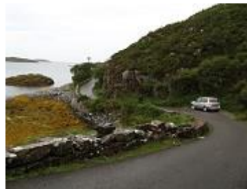
single track near Lochinver