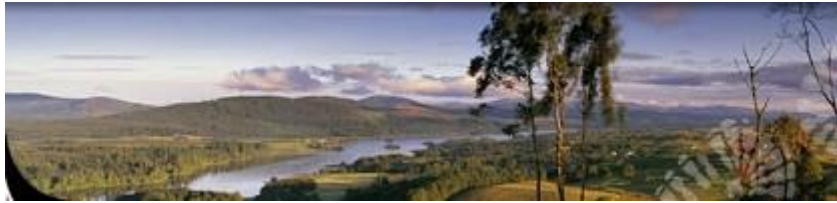
let's find a way