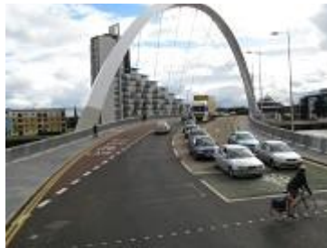
das "schielende" Auge von Glasgow