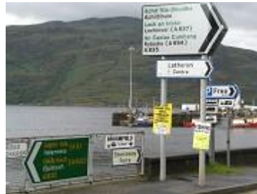
harbor at Ullapool