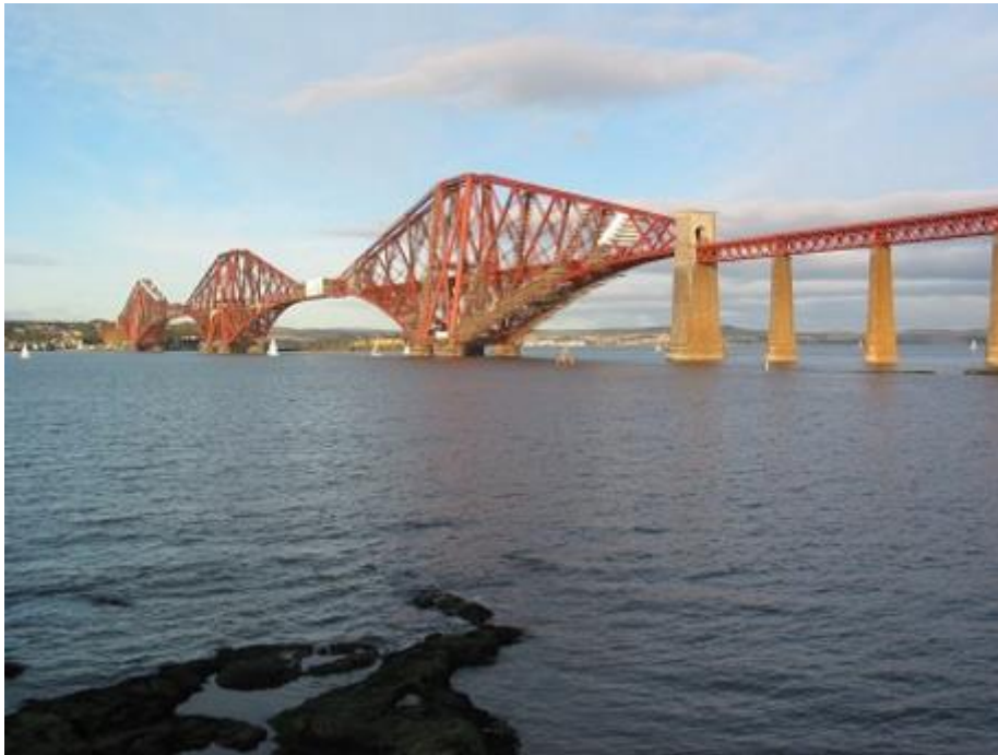
THE FORTH RAIL BRIDGE near Edinburgh (built 1883 - 1890) - more interesting details

Diesen Sommer ging's ab nach Schottland.....