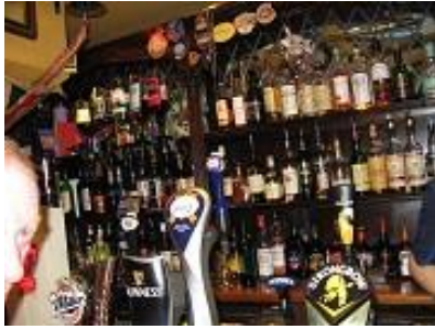
a famous pup in Oban - click for more!